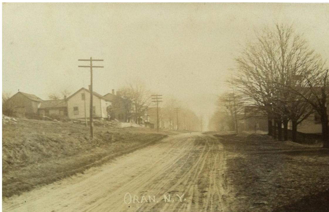
Photograph (circa 1911) of Cherry Valley Turnpike, looking east. The Oran Schoolhouse is the building on the right.

The Schoolhouse lot is located at the corner intersection of State Route 92 and Oran-Delphi Road. It is clear that the Schoolhouse has always been close to the road. The photograph below, from a postcard dated 1911, shows the close proximity of the building to the road. The building on the right, surrounded by trees, is the Schoolhouse. At the time of this photograph, the road was known as the Cherry Valley Turnpike that connected Manlius and Cazenovia.