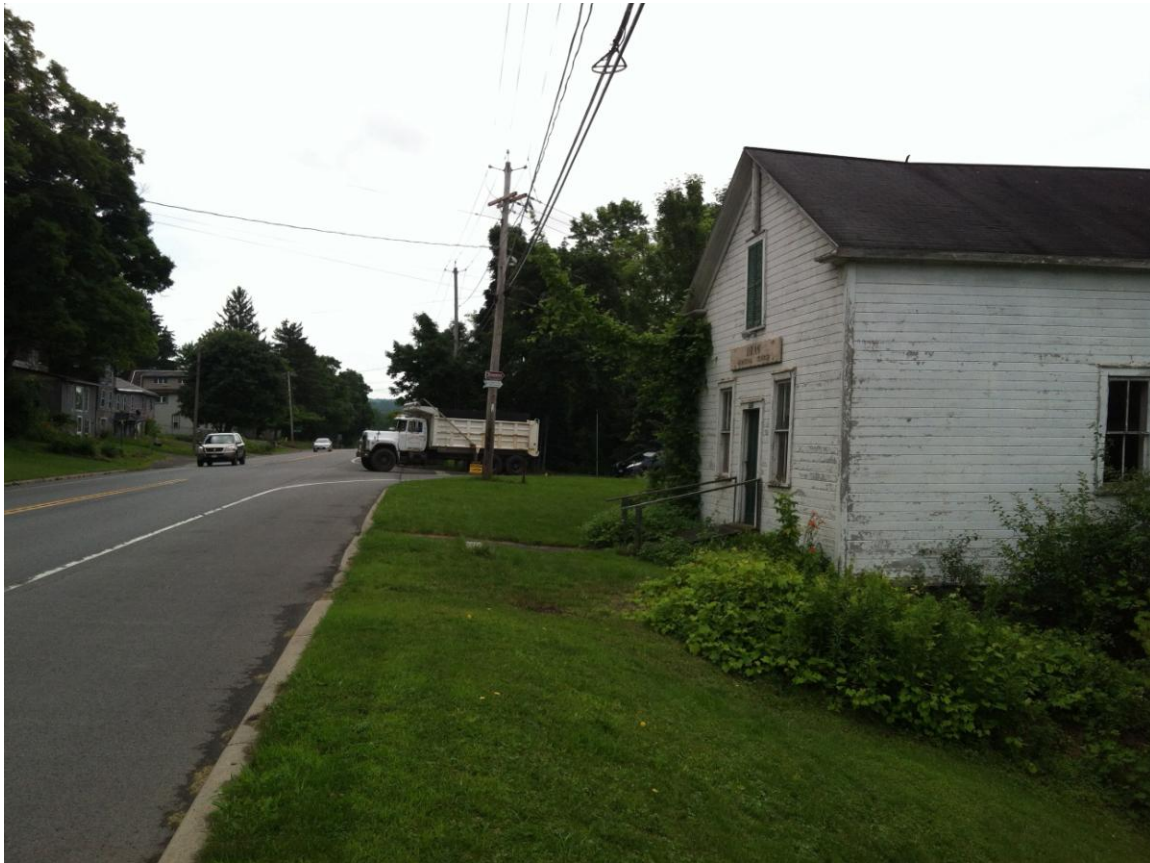
Photograph (July 2015) of State Route 92, looking east. The Oran Schoolhouse is the building on the right.

current state of the highway and the close proximity of the Schoolhouse building (on the right) to the road. It is 21 feet 7” from the building front door to the curb of the highway shoulder.